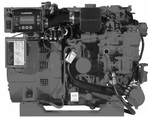
5.5/5.0 EDCA Marine Diesel Generator

Operating at 1800-rpm with a newly designed, tuned air intake silencer and 3-cylinder engine, the 5.5 EDC generator runs smooth and quiet. Augmenting this desired effect is the electronic governing that virtually eliminates "droop" when load is applied. Include the optional Sound Guard SST with high quality stainless steel base and frame with stylish powder coated aluminum panels and you have a generator as attractive as it is quiet.